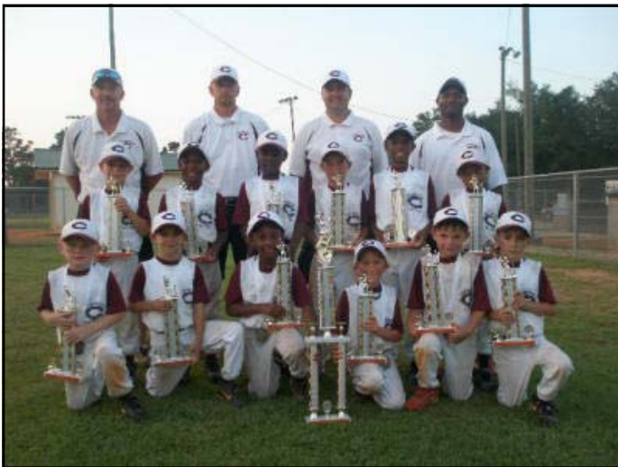
2009 CHAMPIONS Cantonment White

June 30 - Last day for suggested rule changes to be mailed to the TEE BALL BASEBALL Commissioner.